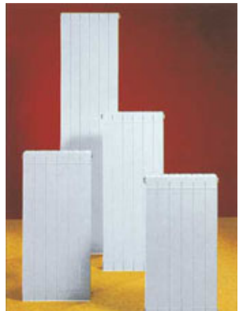
Graduate & Highrise