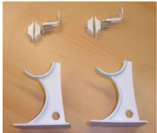
Floor mounted with retaining stays (optional extra).