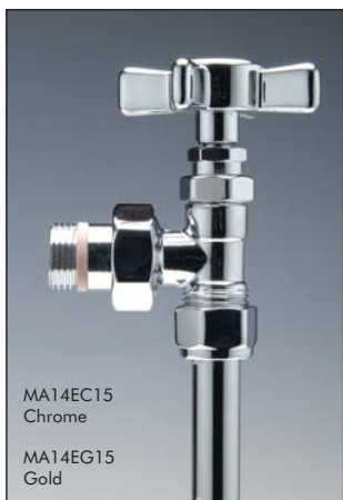
MA14EC15 Chrome MA14EG15 Gold