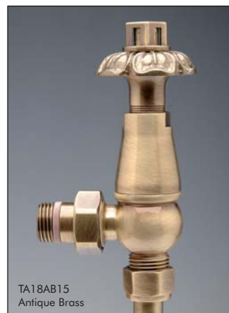
TA18AB15 Antique Brass