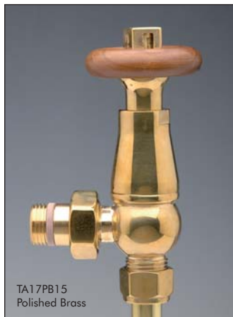
TA17PB15 Polished Brass