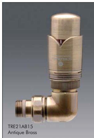
TRE21AB15 Antique Brass