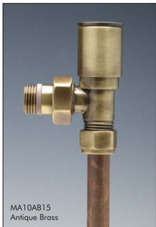
MA10AB15 Antique Brass