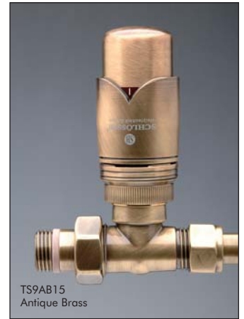
TS9AB15 Antique Brass