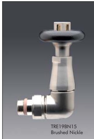
TRE19BN15 Brushed Nickel