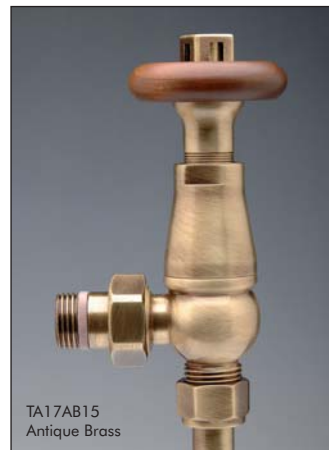
TA17AB15 Antique Brass