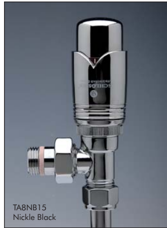
TA8NB15 Nickle Black