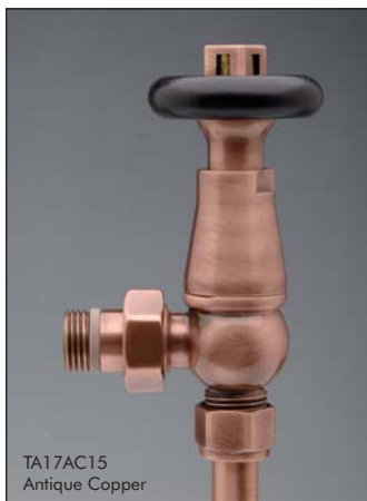
TA17AC15 Antique Copper