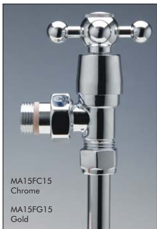
MA15FC15 Chrome MA15FG15 Gold