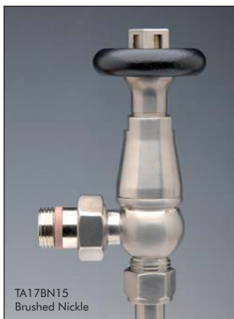
TA17BN15 Brushed Nickel