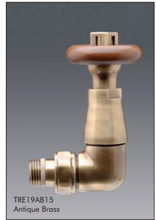
TRE19AB15 Antique Brass