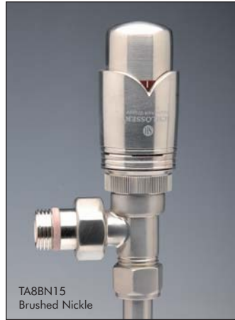
TA8BN15 Brushed Nickel