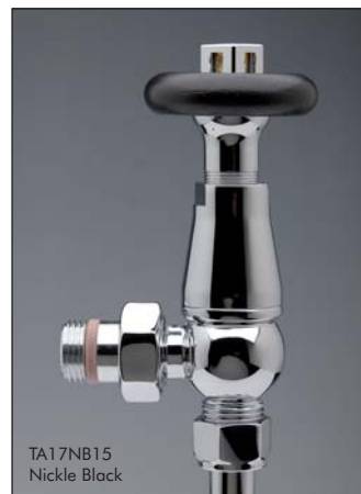
TA17NB15 Nickel Black

When ordering valve sets please check that the correct product codes are used, preferably with a description.