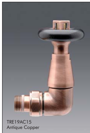
TRE19AC15 Antique Copper