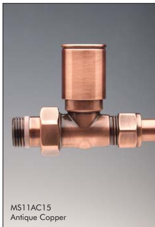
MS11AC15 Antique Copper