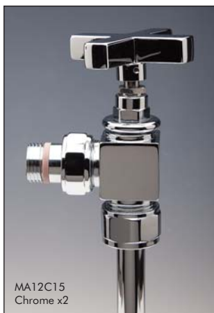
MA12C15 Chrome x2