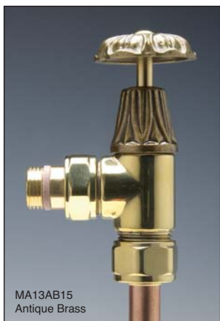
MA13AB15 Antique Brass