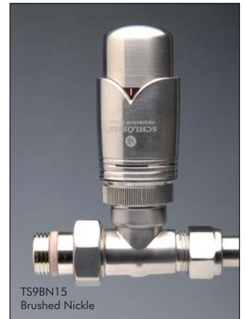
TS9BN15 Brushed Nickel

When ordering valve sets please check that the correct product codes are used, preferably with a description.