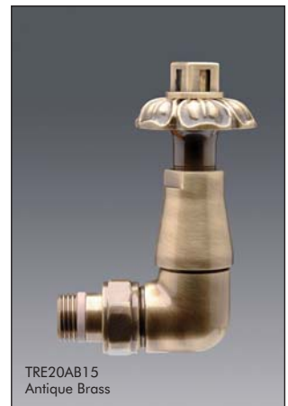
TRE20AB15 Antique Brass