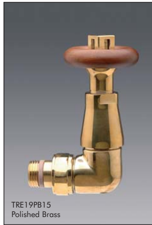
TRE19PB15 Polished Brass