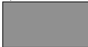
Dark Grey RAL 7004