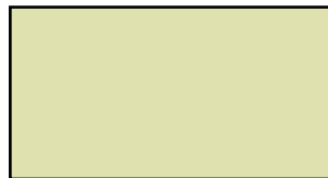
Beige RAL 1015