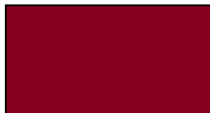
Dark Red RAL 3003