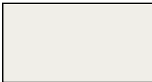
Pergamon RAL 9001

These swatches are a close guide only and should not be relied upon as colours may vary in the printing process.