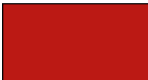
Red RAL 3000