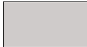
Grey RAL 7035