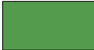
Green RAL 6010